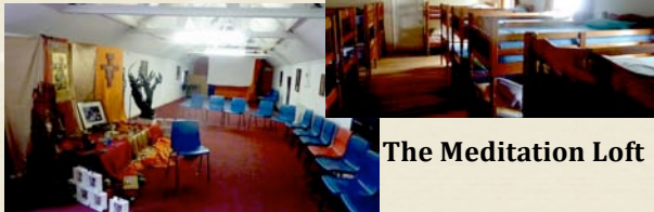
The Meditation Loft